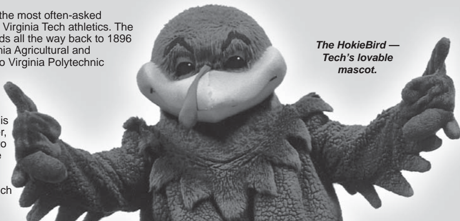
The HokieBird — Tech's lovable mascot.

That's the most often-asked question at Virginia Tech athletics. The answer leads all the way back to 1896 when Virginia Agricultural and