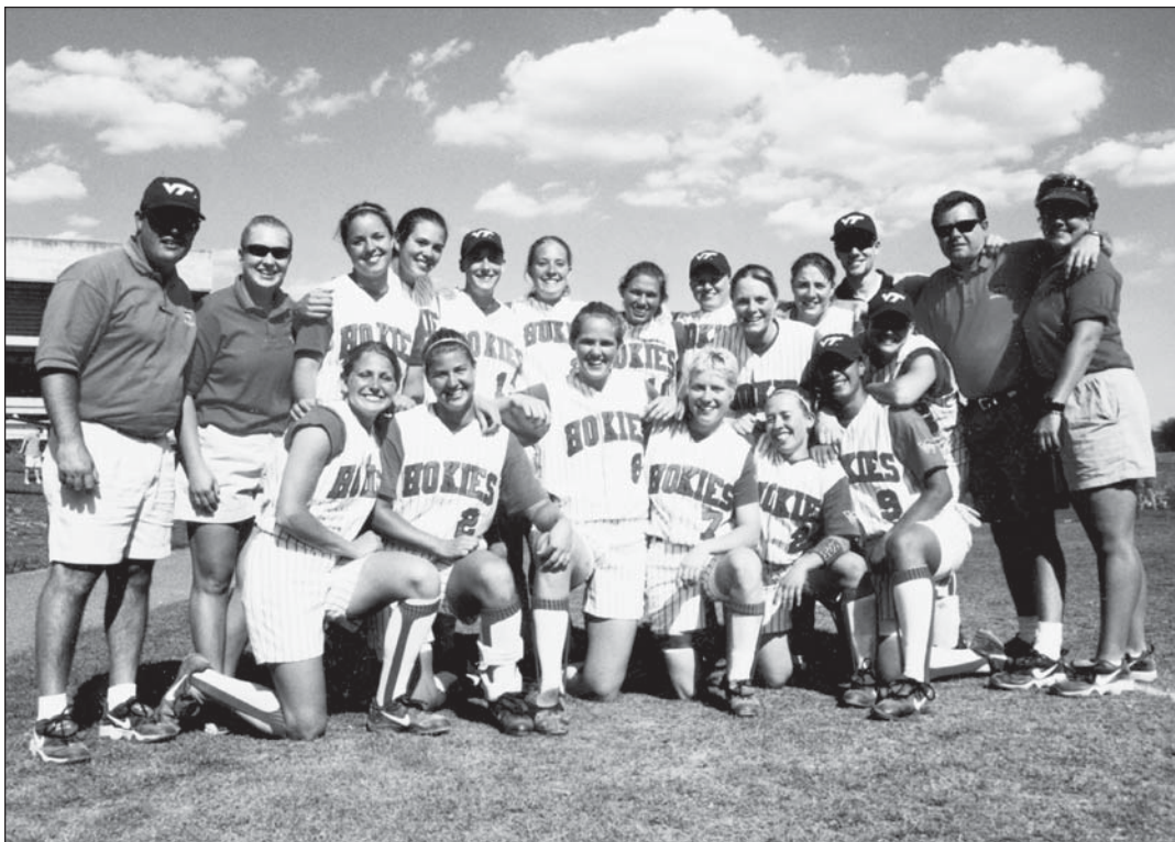
The 1999 team won a school-record 54 games and went 18-0 at home.