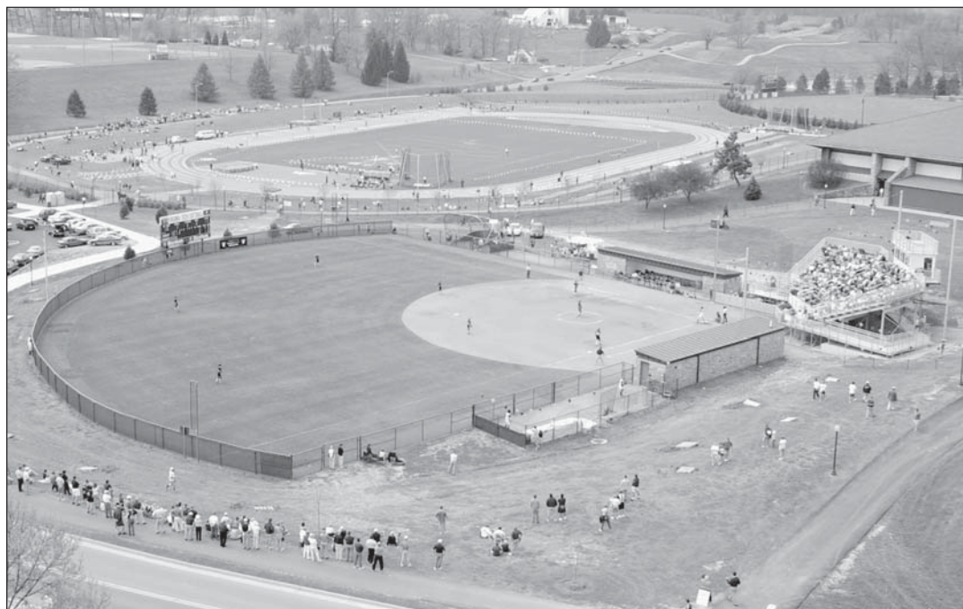
With permanent seat-back bleachers, handicap accessibility and a modern press box, Tech Softball Field has become one of the best facilities around.

campaign in 1999, a 20-3 performance in 2000 and an 18-4 campaign a year ago. In 1999, permanent bench-back seats were added. With the new bleachers, the complex can easily hold up to 500 fans. At the top of the new seats is a fabricated, 8-by-18 foot press box. Complete with power and phone lines, it accommodates all the needs of the media. A state-of-the-art scoreboard was installed during the 1998 season, making it easier for coaches, players and fans to keep up with the game. When weather doesn't allow for outdoor practice, the team moves into Rector Field House. Located adjacent to the playing field, the field house has an artificial surface, batting cages and ample room for drills. It is also equipped with a training room. Batting cages, on-site dressing rooms and lights are possible projects in the future. In addition, the athletic department is in the process of preparing to build a new field house next to Cassell Coliseum. Preliminary plans call for the field house to have a separate level with batting cages for both the softball and baseball teams to use.