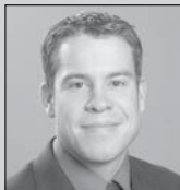
Jed Hurt Scoreboard