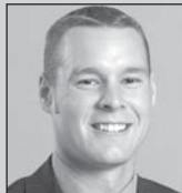
Eric Cross Equipment