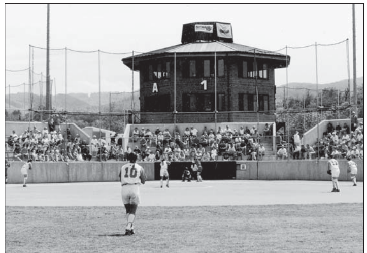
The Moyer Softball Complex in Salem, Va., is home to the 2002 and 2003 BIG EAST Softball Tournaments.

Last year, Connecticut, the No. 3 seed, won the tournament at Villanova. But the Huskies weren't the only one invited to the NCAAs as Notre Dame and Seton Hall also made it to the postseason.