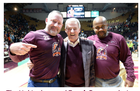
The Hokies honored Frank Beamer during the win over UNC for his selection to the College Football Hall of Fame.

The Hokies continue on this road swing Wednesday night at nationally-ranked Duke ... Tip is at 7 p.m. and the game will be shown live on ESPN2 and the ESPN app.