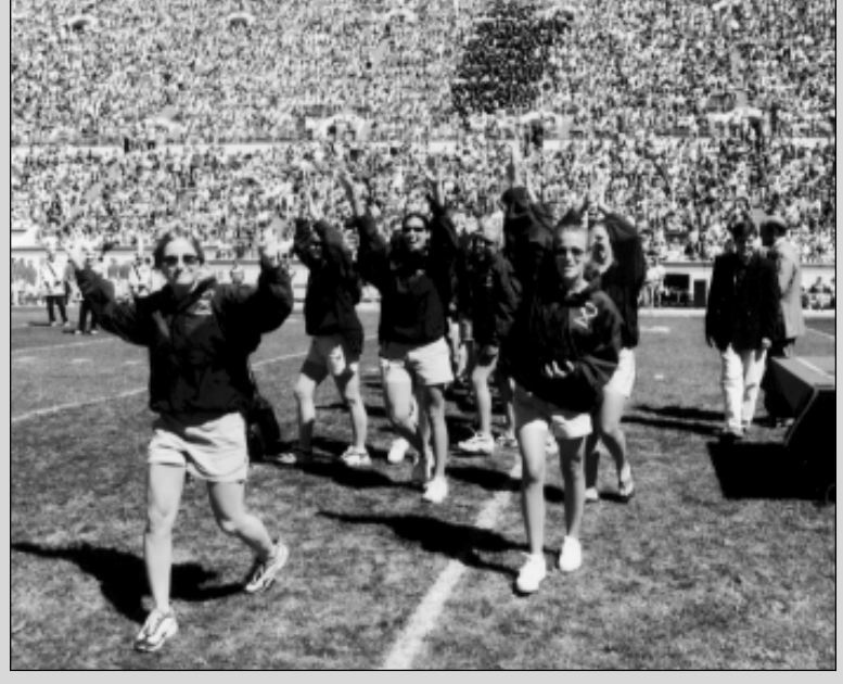
The Hokies are honored in front of more than 50,000 fans at Lane Stadium during halftime of a football game.