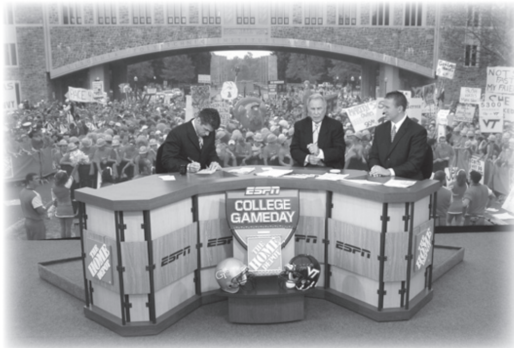
ESPN's College GameDay crew made two appearances on the Virginia Tech campus last fall.