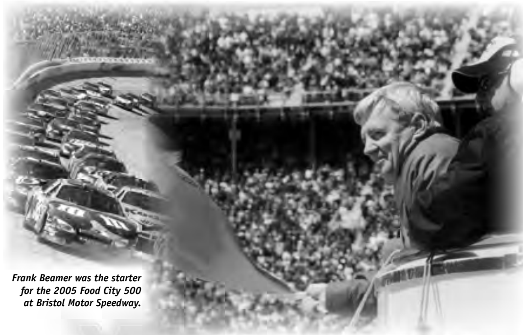
Frank Beamer was the starter for the 2005 Food City 500 at Bristol Motor Speedway.

Beamer's early Tech teams also registered many exciting victories. One of the most impressive came in 1990 when the Hokies capped the year with a 38-13 victory over arch-rival Virginia before a crowd of 54,157, which at the