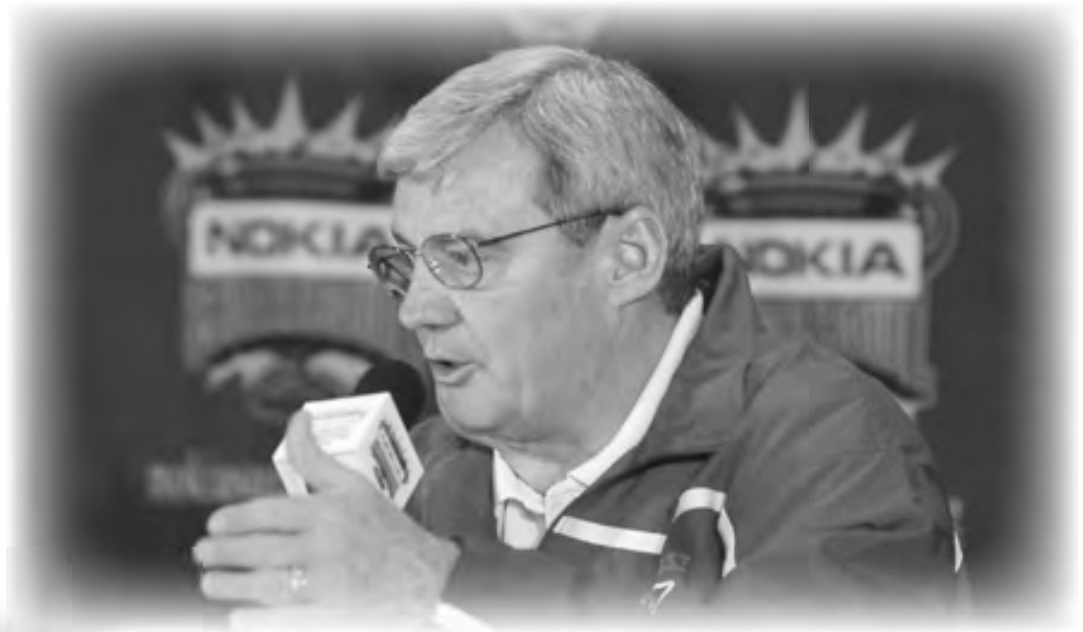
Frank Beamer speaks to the media prior to the 2005 Nokia Sugar Bowl game in New Orleans.

In 2000, Beamer and his staff directed Tech to an 11-1 record after opening the season with eight new starters on defense and an all-new lineup in the