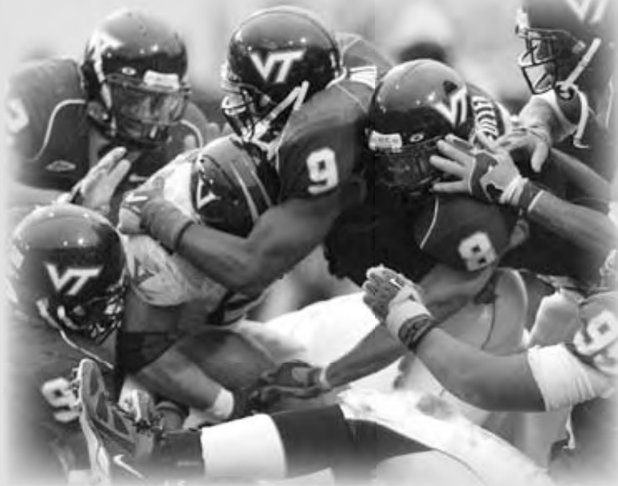
The Virginia Tech defense stuffs a Virginia ball-carrier during the Hokies' 24-10 win last season.